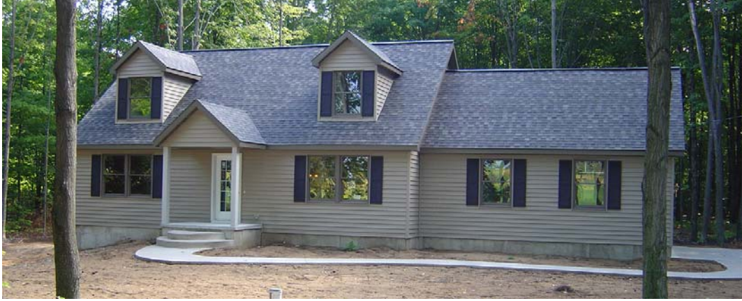
Picture may show options not included in the above price