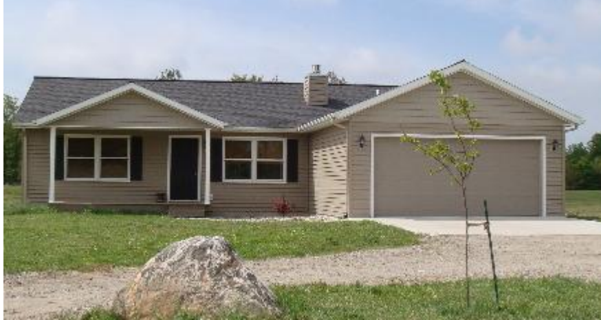
Picture may show options not included in the above price